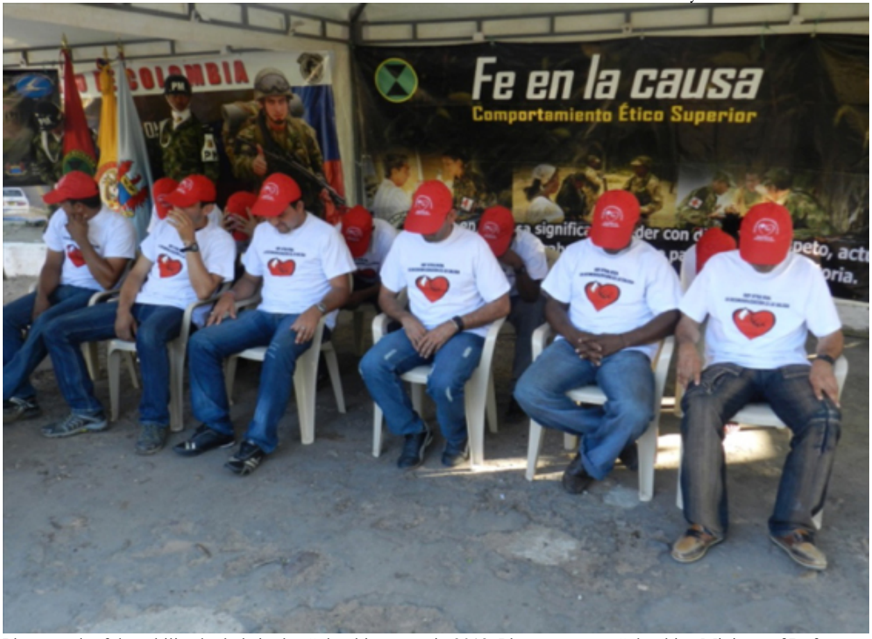
Photograph of demobilized rebels in the Colombian coast in 2012.