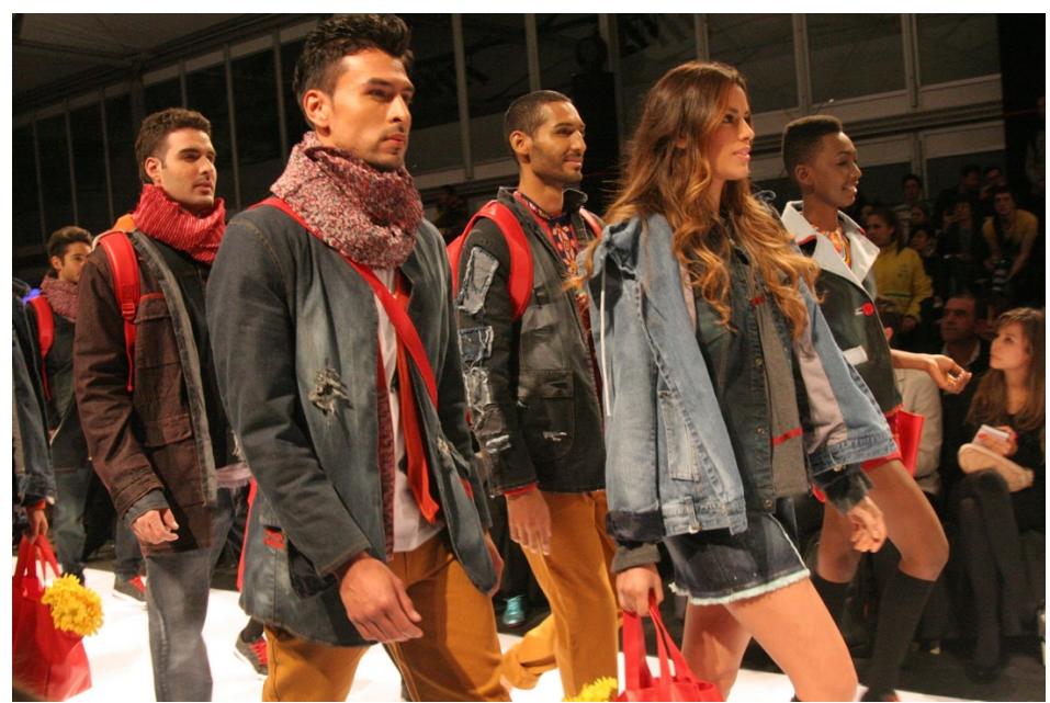
Models stride down the runway wearing the Chance fashion line designed my ex-combatants with the help of fashion designer Sandra Cabrales.

Do you agree with Fattal's analysis of this image, on page 182-183, of the Chance fashion show?