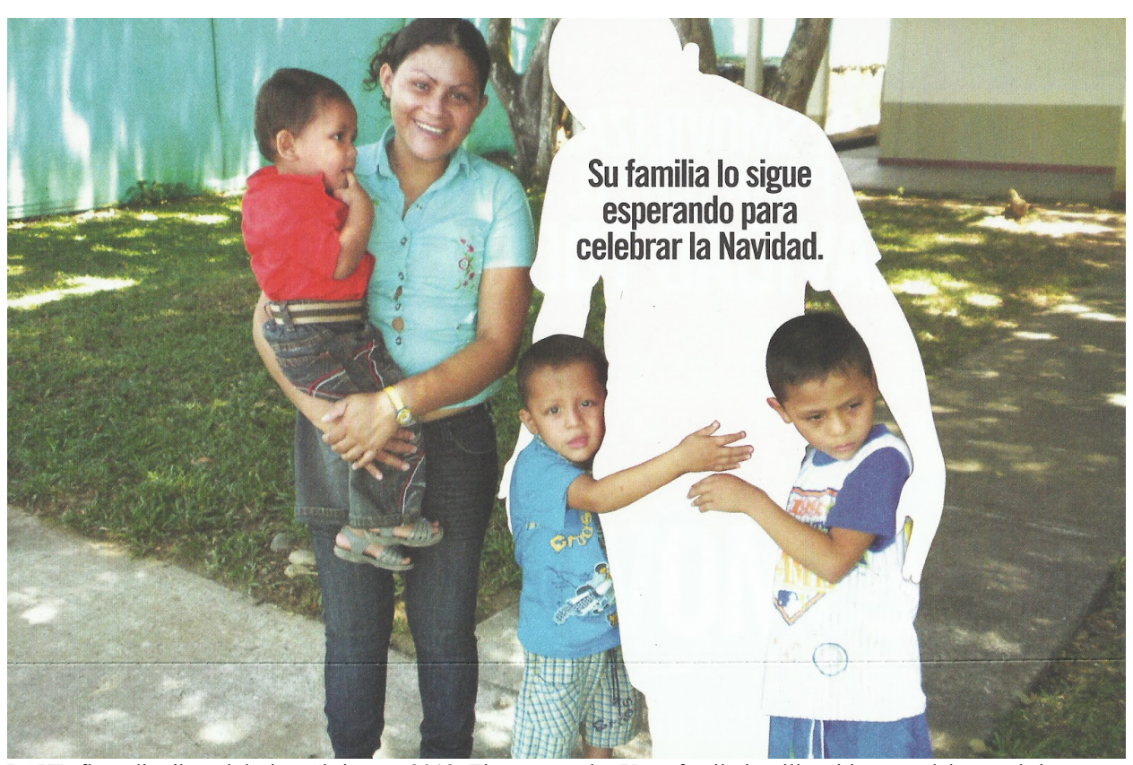
PAHD flyer distributed during Christmas 2012. The text reads "Your family is still waiting to celebrate Christmas.

How does this image relate to Juan Felipe Hoyos's interpretation of the demobilized as prodigal sons (and daughters)?