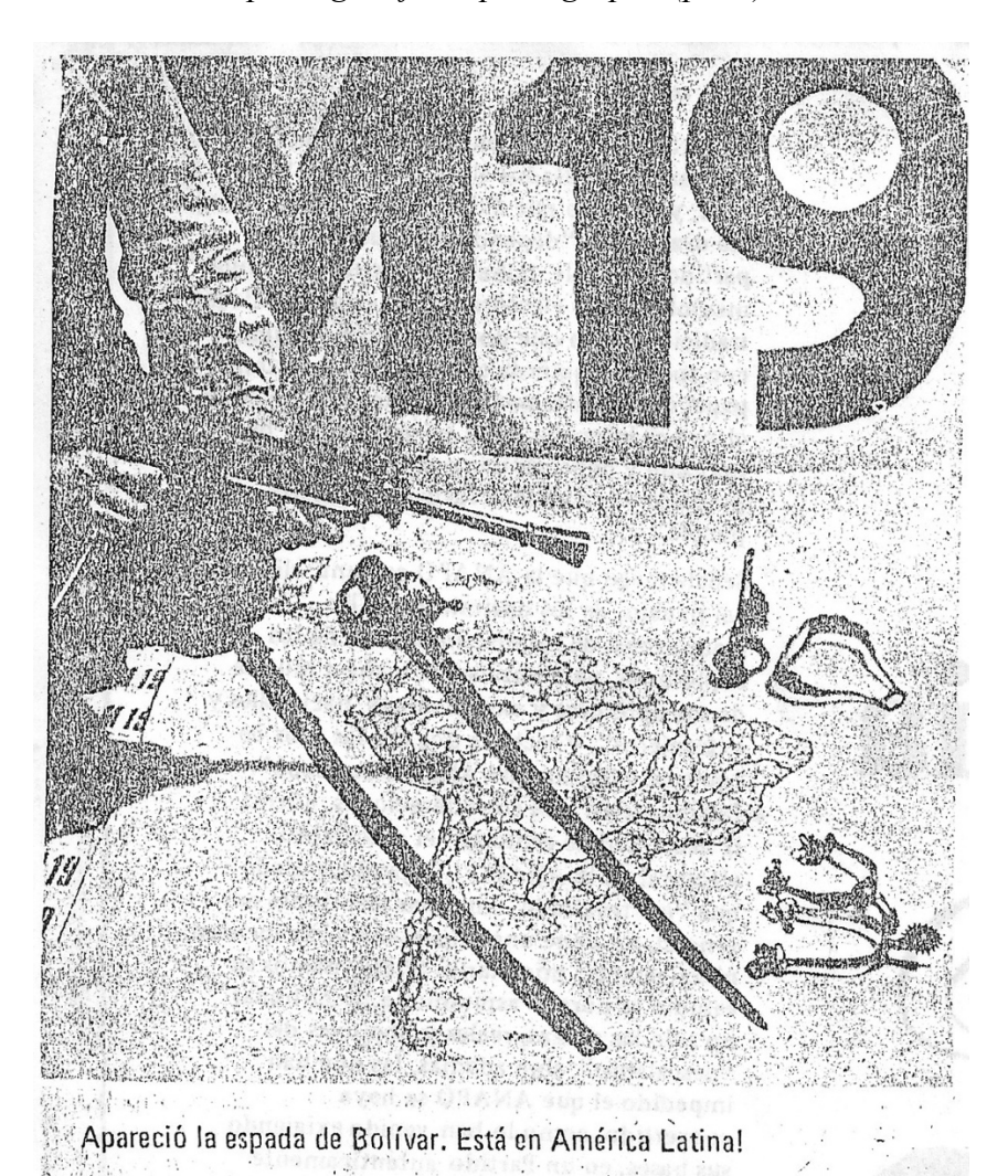
Photograph featured in Alternativa , Feb. 15–28, first issue, page 24. The caption reads, "Bolívar's sword appeared. It is in Latin America!" Image scanned from print edition.

What was the relationship between the M19 and Alternativa magazine? How do you understand that relationship in light of this photograph? (p. 48)